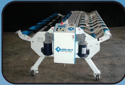
ONE PERSON OPERATION

Wrap around foot cable control, spring loaded roll up arm, speed control, auto run feature and open ended cradles provide for ease of use. All are standard features on the J-2!