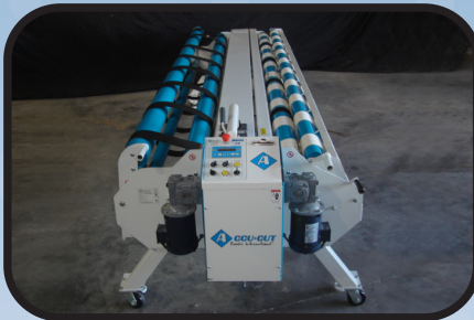
SPACE SAVING DESIGN

The J-2's convenient fold-in cradles minimize the floor space required. At 48 inches wide the J-2 can easily be stored under your storage rack!