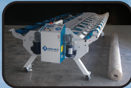
CUT PIECE REMOVAL

All Accu-Cut machines are equipped with a cut piece dumping mechanism to off load your cut length. Make multiple cuts off of one roll without using your forklift to remove the cut length!