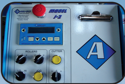
USER FRIENDLY CONTROLS

Directional switches control the rollers and cutter - the yellow push buttons activate them. Speed selection switch, easy to use PLC interface and emergency stop button. An auto-run feature makes operating the machine even simpler!