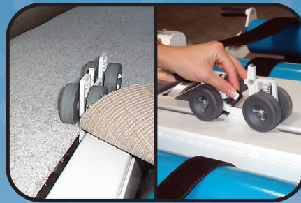
FAST, STRAIGHT CUTS

Patented, two direction, chain driven cutter uses standard blades and applies pressure to the material being cut. Get a straight, clean cut every time!