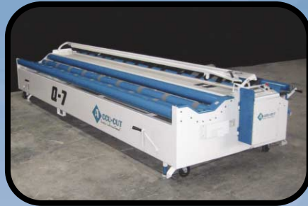
ONE PERSON OPERATION