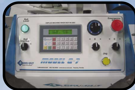
USER FRIENDLY CONTROLS

An auto-run feature makes operating the machine even simpler!