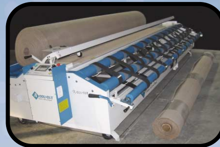
CUT PIECE REMOVAL

All Accu-Cut machines are equipped with a cut piece dumping mechanism to off load your cut length. Make multiple cuts off of one roll without using your forklift to remove the cut length!