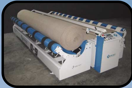
ONE PERSON OPERATION