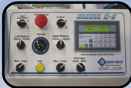
USER FRIENDLY CONTROLS

Pneumatically powered roll-up arm and load cradle make operating the machine even simpler!