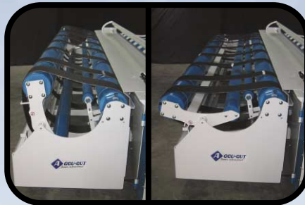
ADJUSTABLE, SQUARING CRADLE

Effortlessly provides full control over the material!