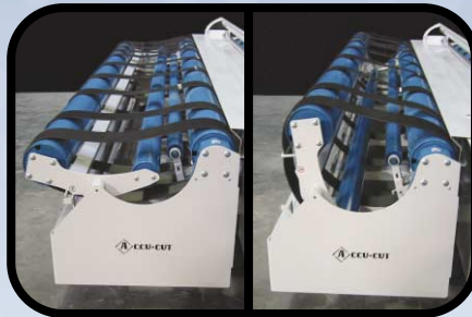
ADJUSTABLE, SQUARING CRADLE

Effortlessly provides full control over the material!