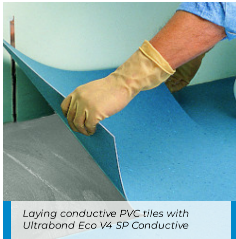
Laying conductive PVC tiles with Ultrabond Eco V4 SP Conductive