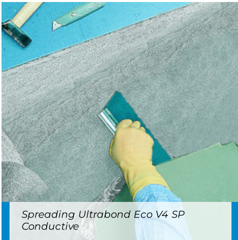
Spreading Ultrabond Eco V4 SP Conductive