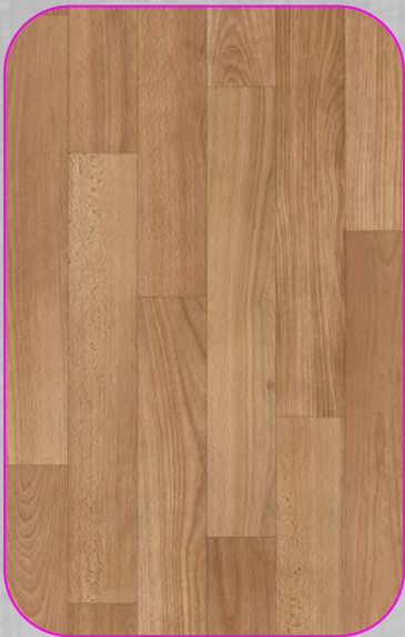
Natural Beech 416M