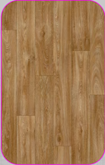
Havanna Oak 602M