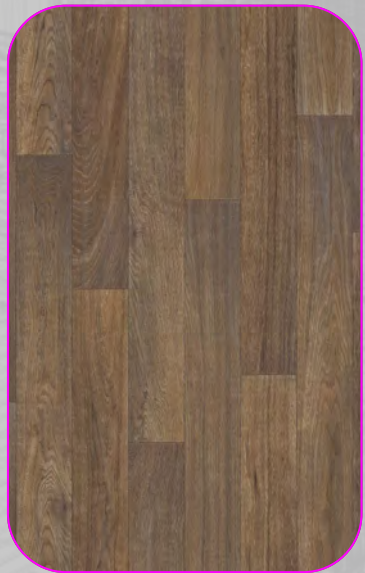
Natural Oak 369M