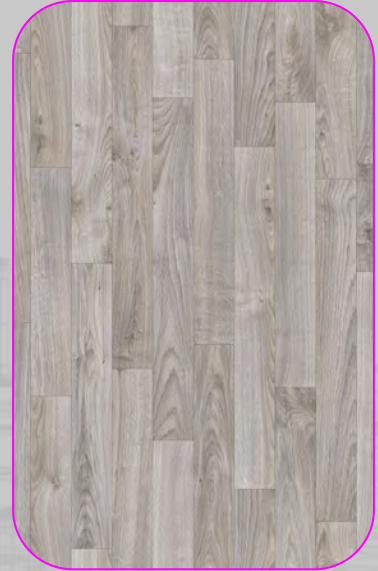
Honey Oak 961M