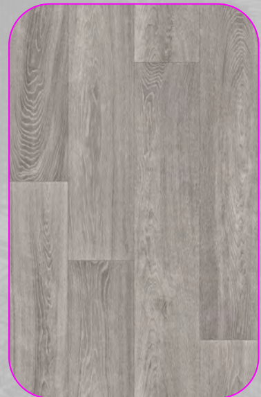
Pure Oak 904M