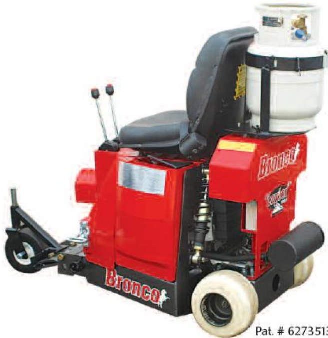
Pat. # 6273513